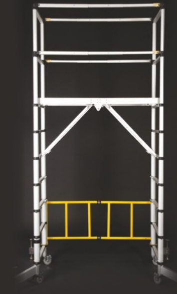
Fully erect Platform 2.00m

Without wheels: Height 83cms. Width 81cms. Depth 42cms.